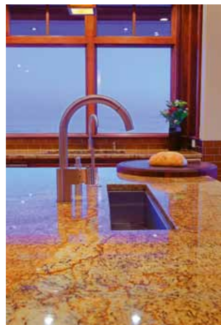
ABOVE: State of the art and energy saving appliances blend into the kitchen with custom cabinetry.