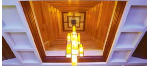
BELOW: This art glass and iron fixture is one example of Wilkinson's original design work.