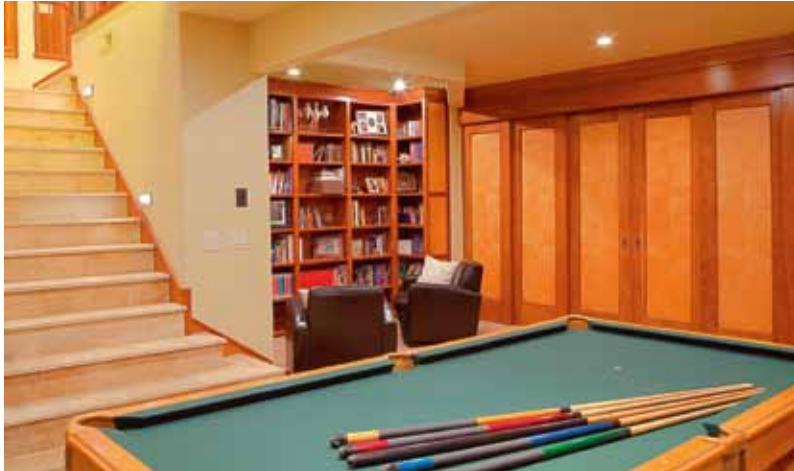
LEFT: The elegant and contemporary theme of the home carries throughout the house.