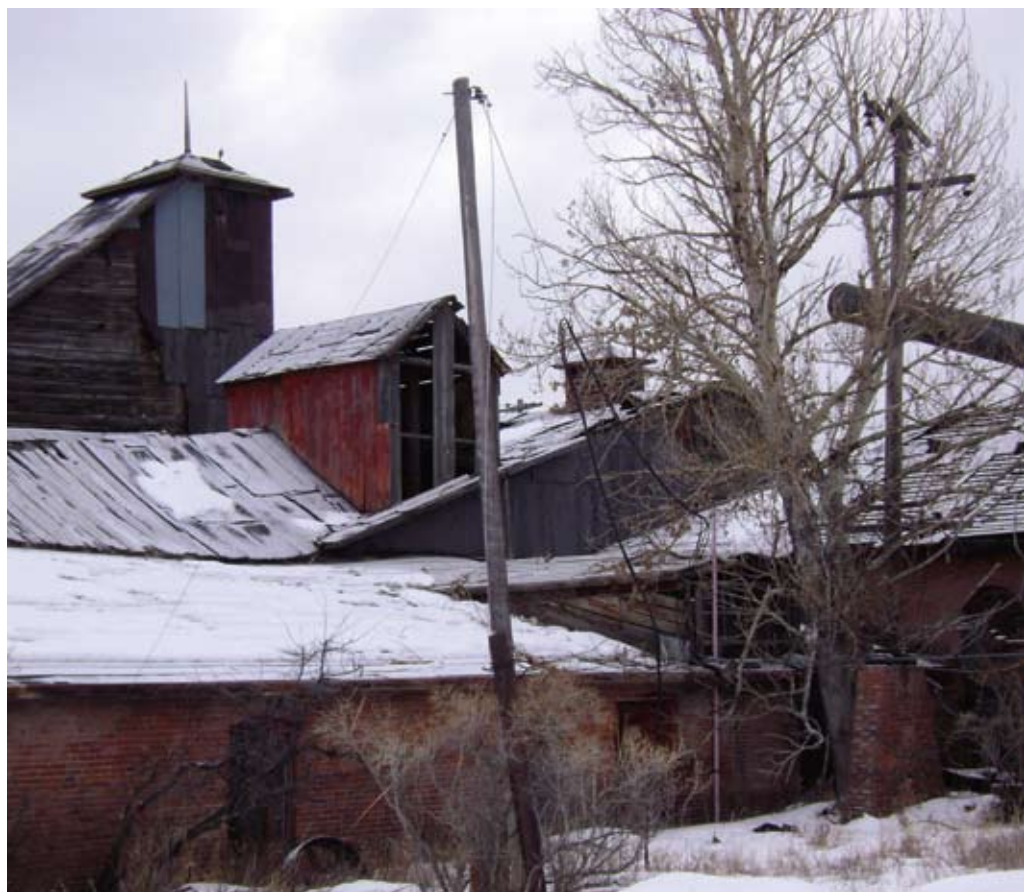
RIGHT: The abandoned buildings and equipment of the historic brickyard, listed in the National Register of Historic Places, blend into the newer landscape at the Archie Bray.