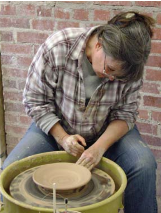
The Bray welcomes both professional and amateur artists. Here, a student potter concentrates on the wheel.